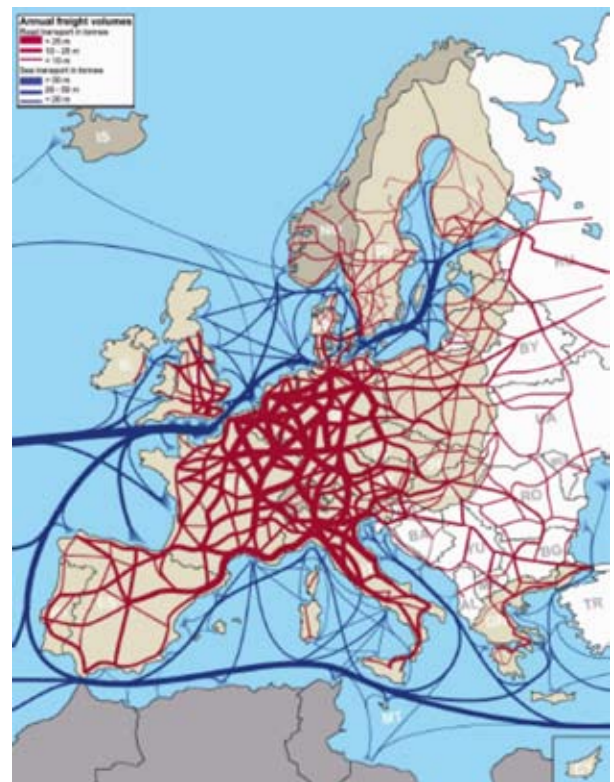
Fig. 2. Freight transport density in Europe and maritime links