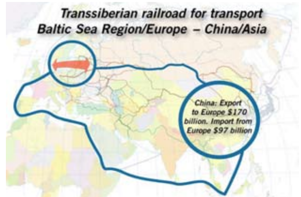
Fig. 1. Existing and possible transport directions between the Far East (China) and West Europe