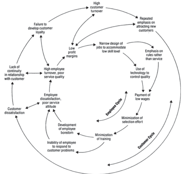
Fig. 2. The cycle of success in services

It is found that there are strong correlations between employees' attitudes and the perceptions of service quality in the same organization (Lovelock 2001). The success cycle is shown as Fig. 2 (Schlesinger and Heskett 1991).