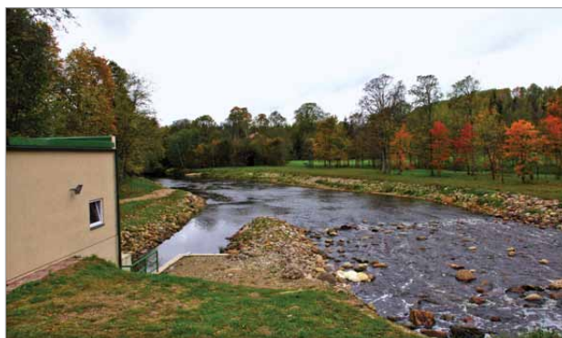
Fig. 7. Water surface overgrowth with water-plants on the lower part of a sluice: Almost none observed.