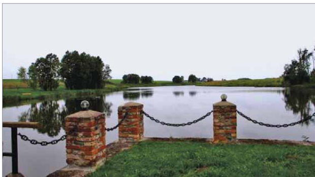
Fig. 3. Open views to surrounding landscape from a watermill. Source: Lazdāne's private archive, 2012

features and/or residential housing. As far as noise impacts are concerned, as researched previously by several other authors ( e. g. , Babish et al. 2005; Stansfeld et al. 2005; Bluhm et al. 2007; Gidlof-Gunnarsson and Ohrstrom 2007), traffic noise may cause non-auditory stress effects such as changes in the physiological systems, various cognitive deficits, and sleep disturbances, modifications of social behaviour, psychosocial stress-related symptoms, and emotional/motivational effects. Noise can be characterised by its frequency content, perceived loudness of complex sounds, different noise types, etc. (Berglund et al. 1999). The existing condition of low noise intensity has to be carefully maintained in future developments. For example, noise may be caused on these sites by different forms of entertainment ( e. g. , sports and music events) (Berglund et al. 1999). However, there is also a need to understand that different people will respond quite differently to the same noise stimulus (Job 1988).