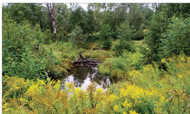
Fig. 8. Water surface overgrowth with water-plants on the lower part of the sluice: overgrowth with water-plants in almost all territory of the water surface.