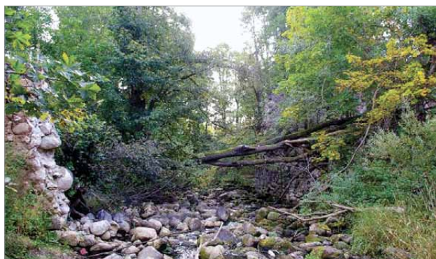
Fig. 4. Ruined sluices of a dam on a watermill reservoir.