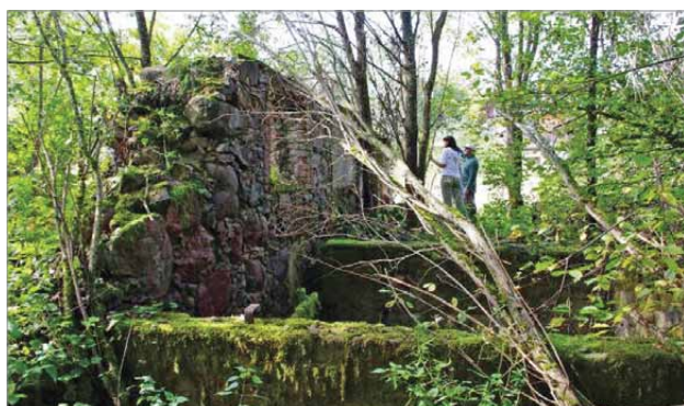
Fig. 5. Trees inside the ruins of an old watermill building.