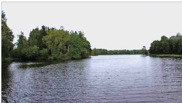
Fig. 2. Enclosure of trees (forest) on a small-scale HPP water reservoir.

All 42 landscapes of watermills and small-scale HPPs were visited and researched. The results show that landscapes assessable by ecological aspect are mainly located in a place surrounded by trees (D.2.2 – 17%, D.2.3 – 21%, D.2.4 – 24%) (Fig. 2), and only 38 percent of the territories contain several open views in the landscapes surrounded by trees (Fig. 3). If a dense arrangement of trees and bushes and other flora gives sufficient space to link various habitat types, then their percentage is high in the researched territories. Diverse ecological systems require connections to keep them alive and functioning (Landscape ... 1997). In these territories, there is also a comfortable micro-climate because of wind shelter (D.0.1 – 50%, D.0.2. – 14%), and silent neighbourhood (D.18.1 – 36%, D.18.2 – 55%). Silent neighbourhood and wind shelter percentages show that there are potentials to develop low intensity recreational