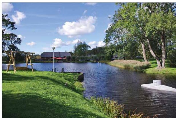
Fig. 6. Water surface overgrowth with water-plants on the upper part of the sluice: Overgrowth with water-plants on the narrow zone along the waterside and/or fragmentarily in the middle.

canoeing and access to waterways, maintenance of water levels in navigable rivers and canals, etc. (Armstrong et al. 2010). The results on the overgrowth of water plants on the upper part of the sluice (Fig. 6) and lower part of the sluice (Figs 7 and 8) are different (D.4, D.5). If we look at the results about the information regarding fishing regulations in