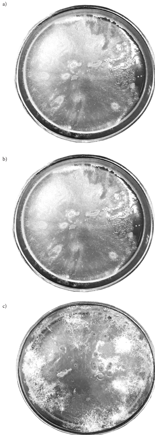
Figure 2. Microbiological analysis of the polluted arctic soil samples: a – 1, b – 2, c – 3 respectively