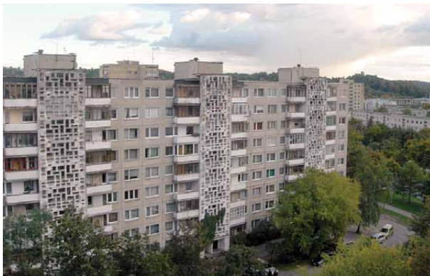
Fig. 1. Prefab panel house in Žirmūnai microdistrict, in Vilnius, Lithuania

Origins of the large scale housing estates lie in the poor housing conditions experienced by working class in the beginning of the 20 th century, when industrialization and urbanization caused big housing shortage. Construction of large prefab estates had reached its peak after the Second World War, when countries had to rebuild their destroyed economies and devastated housing stock. By that time architects and planners of CIAM outlined the new modern city encouraging healthy living and equality for people. They promoted separation of different land uses: residential, employment and transport, with quality of large open green spaces and accessibility by public transport. Modern industrial methods of mass production were used to provide large groups of society with social housing (Fig. 1). The new estates were perceived as a sign of modern, better times (Hall et al. 2005). The new neighbourhoods designed according to modernist ideas and filled with huge housing blocks were usually built outside the traditional urban area, far from the old city centres. They were intentionally separated from the other urban activities and had to act as residential areas for emerging middle class society. Construction of the estates culminated during the 1960s and the 1970s,