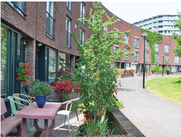
Fig. 6. Bijlmermeer estate in Amsterdam

Note: highway profile street after rehabilitation converted into an urban street with new office building, dwelling blocks and commercial functions, wide bicycle and pedestrian paths