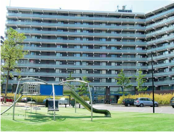
Fig. 4. Bijlmermeer estate in Amsterdam

Place making. Extensive public space is a main characteristic of modernistic estates. However, now green areas are usually, outdated, monotonous and