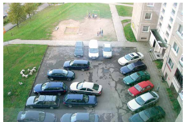
Fig. 3. Car parking in the public space in Justiniškės microdistrict, Vilnius, Lithuania

These processes changed appearance of the housing estates. In soviet era, residential district's feature was expansive park areas, which now are informally converted into parking lots. (Fig. 3) Furthermore during the privatization process majority of the housing stock in the apartment buildings was sold. Privatization brought not clear responsibilities who should maintain common property in the apartment block, or public space around. Big amount of the owners makes management of renovation a difficult task. The result is not maintained, old and outdated houses with uncertain future for renovation. Difficulties of solving problems in the neighbourhoods, as well as opportunities for better housing, encourage a sizable portion of population to solve this situation by moving out to better-off neighbourhoods, especially to those in suburbia (Stanilov 2007).