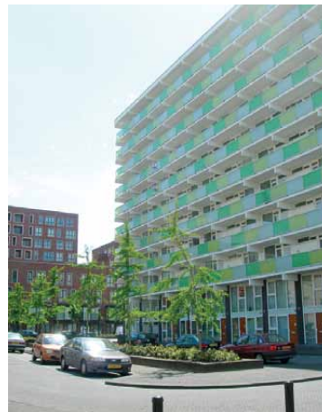
Fig. 7. Bijlmermeer estate in Amsterdam

Note: new housing typologies (single family houses and row houses) during the rehabilitation were build next to old apartment block