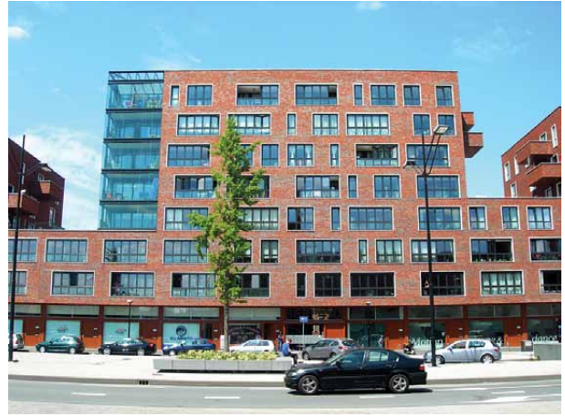
Fig. 5. Bijlmermeer estate in Amsterdam

Note: new public functions, like day-care centres, bicycle repair shops, kiosks, are introduced at the ground floors of the old apartment blocks