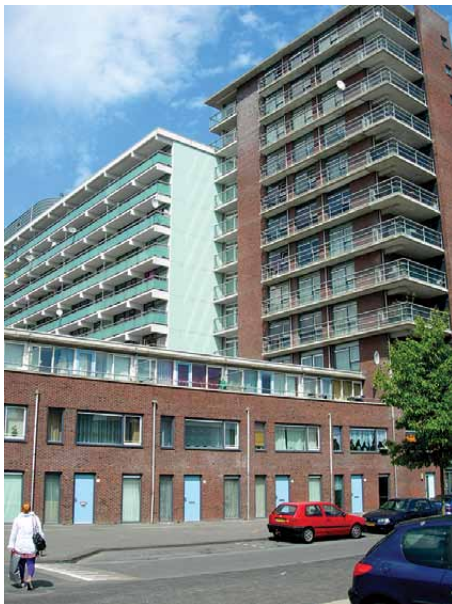
Fig. 8. Bijlmermeer estate in Amsterdam

All in all adding the before mentioned strategies in comprehensive regeneration programs, involving citizens and learning from western policies will give evident results.