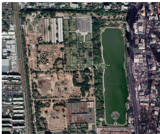
Figure 1. Satellite image of Benjakitti Park

The study was part of an action-research project funded by the Thai Health Promotion Foundation (ThaiHealth) in examining the impacts of minor physical improvements in the public park in Thailand. Benchakitti park was selected for the study because it is one of Bangkok's most prominent and oldest district parks. It can be easily accessed by different modes of public transportations such as bus and underground train and private cars. The park's total area was 130 hectares, with a retention pond for water recreation covered one-third of the area. In 2020, the park area was expanded and are currently undergoing a construction process. Biking and jogging track are surrounding the park, with the west part of the park consist of park facilities such as a playground, fitness equipment, amphitheater, and skateboard park (Figure 1).